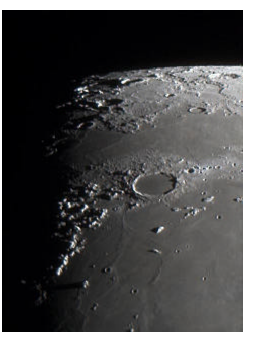
Plato Crater at f/10, 10" LX200GPS, Meade LPI

As with visual astronomy, seeing and focus techniques are the first two keys. If you're working with an OTA that has a shorter focal length, seeing will not be as much of an issue, but focus always is and it can be tough!