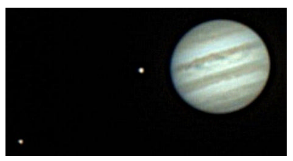
Europa, Ganymede and Jupiter at f/20, 10" LX200GPS, Meade LPI

• A camera. (I'm now going to stop saying duh) This can be anything from a cheap web cam to a top of the line SBIG CCD. It can also be your current digital camera if you can get the right adapters to fit it into your optical train. Again, the type and capability of the camera is going to limit you to certain types of objects