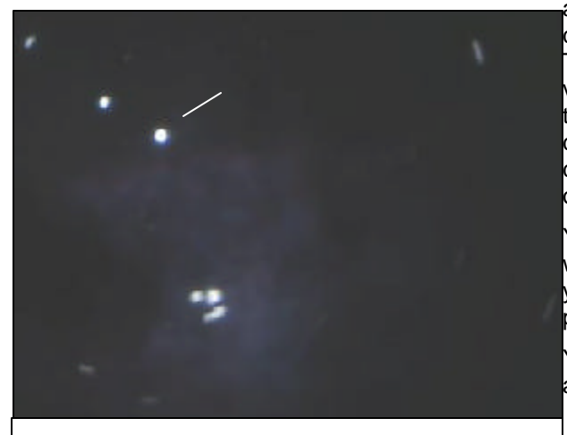
Field Rotation with Alt-Az Mount, 191, Exposures, 26 Minutes

Theta 2 Orionis (follow the arrow) was the star I used to track this image and the camera, mount and software did a good job of tracking on this nice, magnitude 5 star. But you can see that the image is not usable because of the field rotation inherent